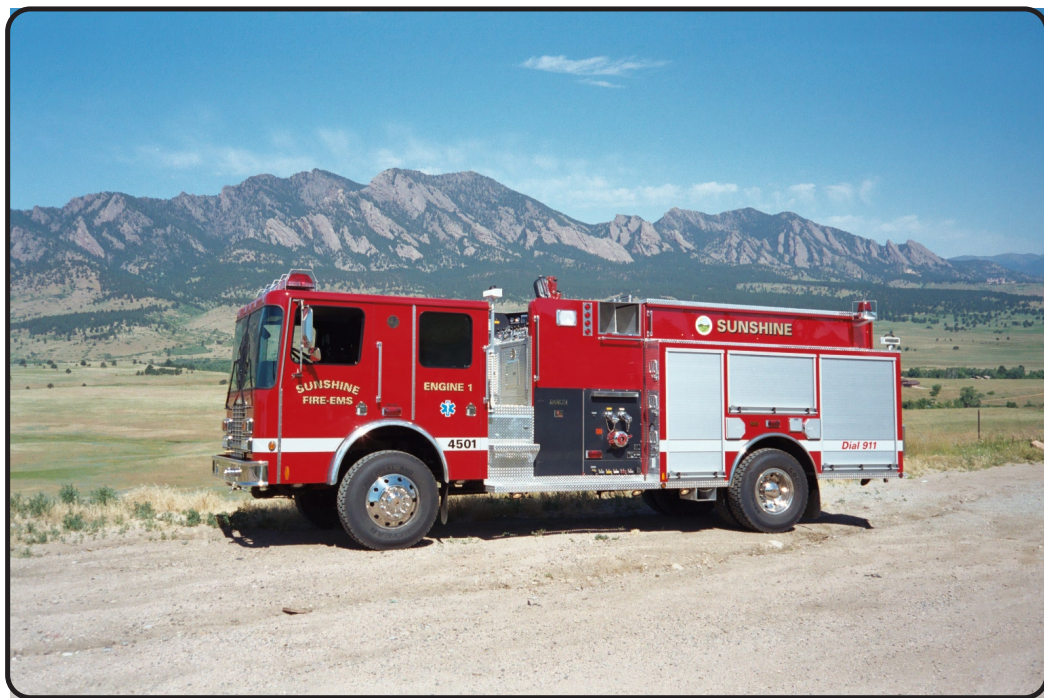
Fire Engine 4501, July 2003