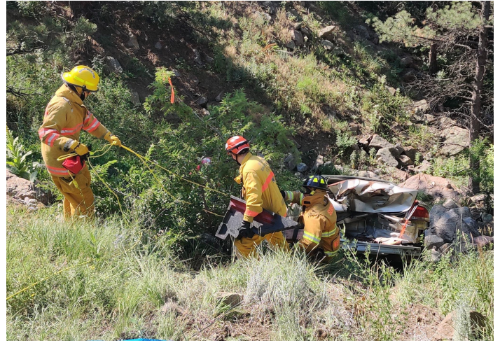
Joint Department Stabilization training